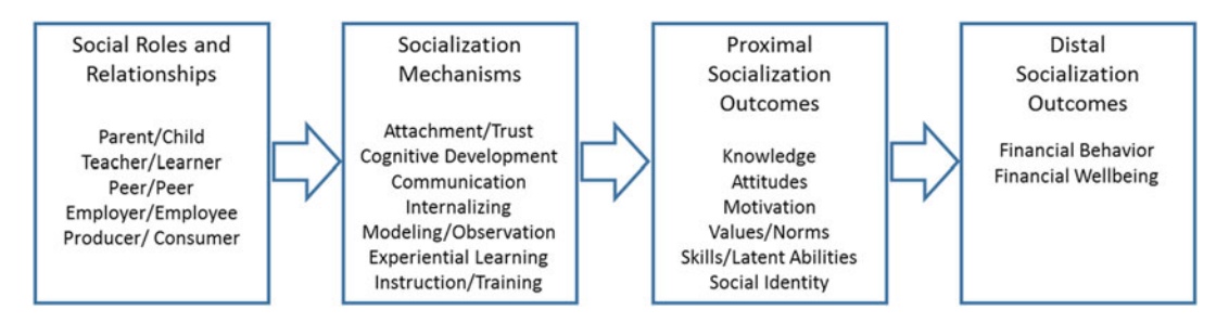
Fig. 5.1 Integrated model of financial socialization processes

Serido, Tang, & Card, 2015), suggesting that the socialization mechanisms may differ within different types of social relationships. Examples of socialization mechanisms that have been previously identified in theoretical papers on financial socialization (John, 1999; Jorgensen & Savla, 2010; Moschis, 1987; Ward, 1974; Xiao, Ford, & Kim, 2011) are included in Fig. 5.1.